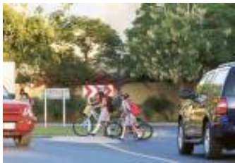
Stalker: School seeks police help