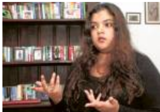
'Please excuse to Indian, Pakistani'