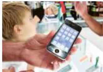
Fake phone business thrives despite deadline